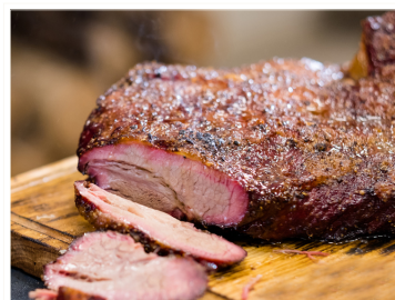
COOKED & HALF COOKED FOOD