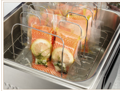
SOU VIDE SALMON, TOMAHAWK