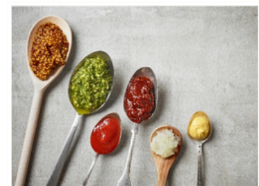
RUBS & SAUCES