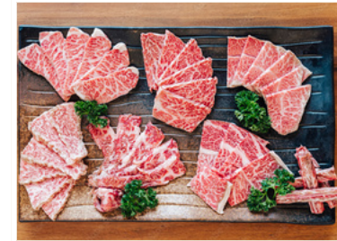
YAKINIKU & SHABU