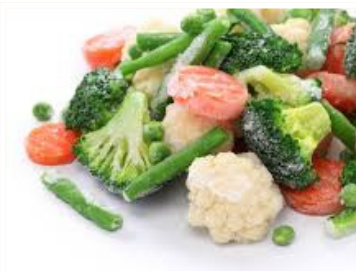
DAIRY & VEGETABLES