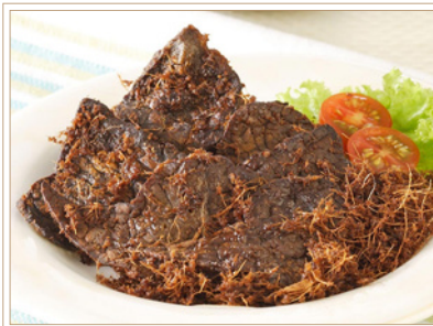
COOKED BEEF LUNG

Be it OEM food solutions, outsourcing certain kitchen operations or looking to shorten your cooking or food preparation time, we've got you covered.