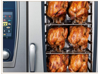
BAKE / ROAST