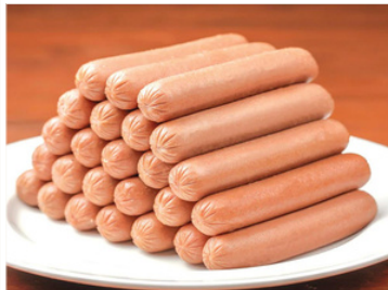
SAUSAGES & HAM